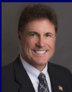
Rep. Jim Dunnigan, UT Secretary

As medical treatments continue to advance, it has opened the door to a wide variety of medical solutions, especially when dealing with very rare diseases. However, the cost of these treatments are extremely high. A value-based purchasing agreement aims to ensure that the cost of the treatment is based on the value that it provides to the pa-