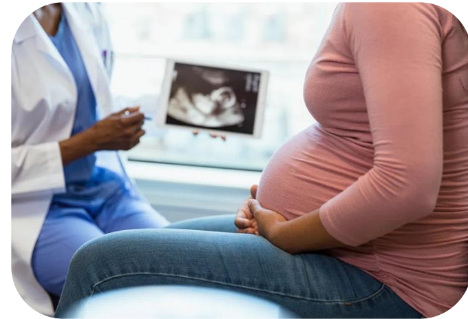
High-Risk Pregnancy Home Delivered Meals