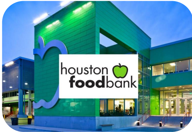
Food RX – Houston Food Bank